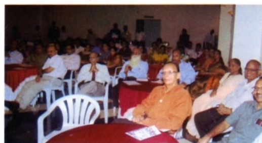
Rotarians, R/Anns and guests at the function