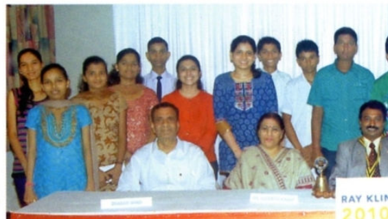
Scholarship Awardees with the Chief Guest, Trustees, President and others