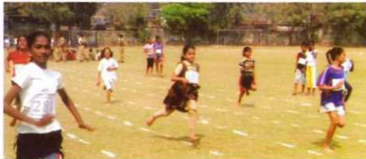
Girls running 100 meters