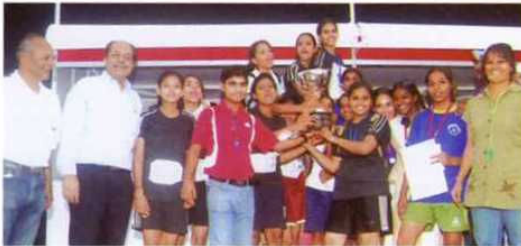
Winners of the girls trophy