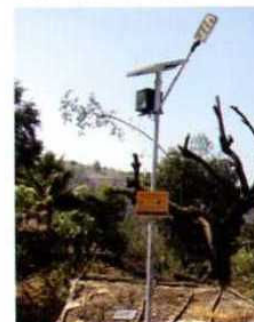
The Solar Street Light