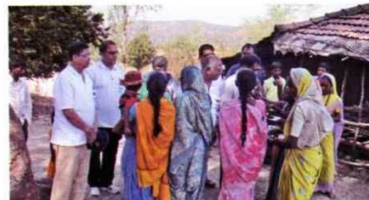
Traditional welcome to Rotarians