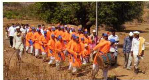
Approaching Karoli village