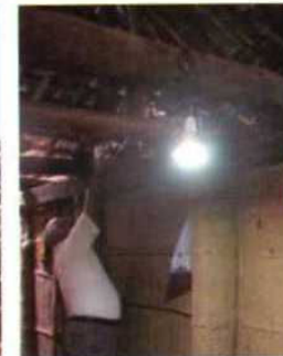
The Solar Light at home