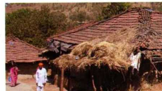
The Solar Panels on the Roofs