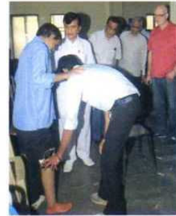
Fixing the Jaipur Foot