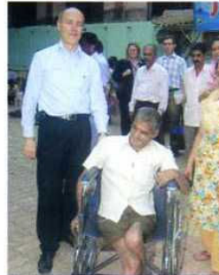
Handing over the wheelchair