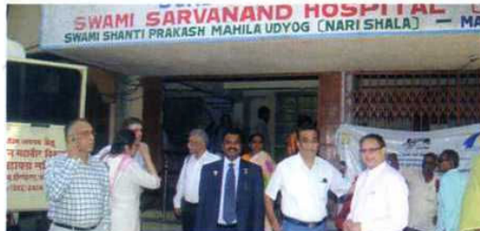
Some of our Rotarians at Swami Sarvanand Hospital