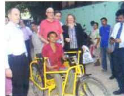
Handing over the Tricycle