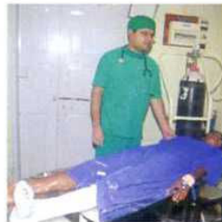
A patient undergoing surgery