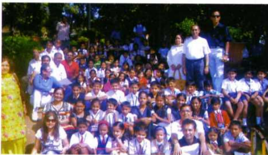
Participants with our members, R/Anns and R/Children