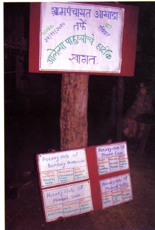
The village 'Akhada' recognizing the support of the Rotary Clubs