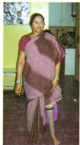
Jaipur Foot patients at the Mahavir Vikalang Sahyata Samiti