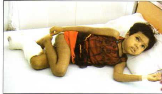
Patient operated on left leg at Parel Hospital